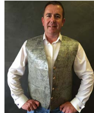
Waistcoat using NanoStone

Let your imagination take inspiration from the flexibility in design and flexibility in use that our unique real stone products offer.